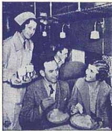
Complimentary meals served afloat on all United Air Lines planes in flight at meal time

SCHEDULES AND FARES —Published in these time tables, effective January 1, 1932, are subject to change without notice.