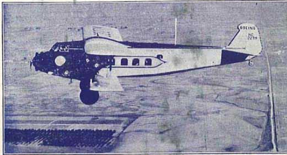
UNITED AIR LINES "COAST TO COAST LIMITED"

Now "It Costs No More to Travel by Air" When You Fly With United Air Lines