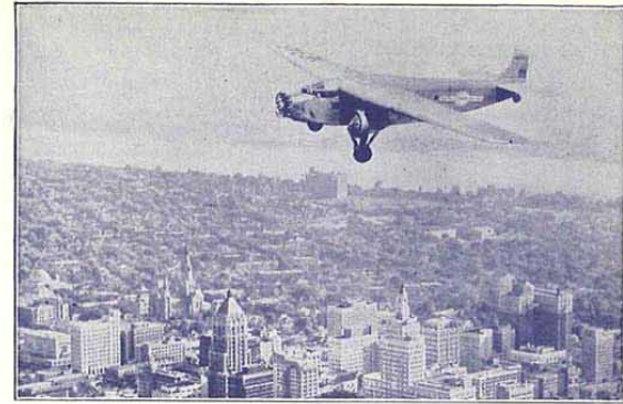
Powered by the reliable P & W "Wasp" and "Hornet" engines, United's fleet of 100 late-type planes fly 35,000 miles daily for a total of 12,000,000 miles annually serving 42 cities in 18 states.