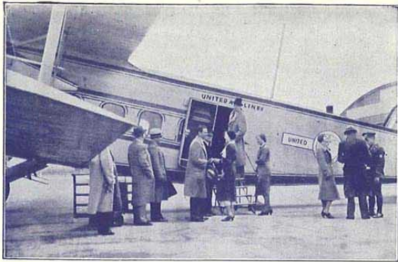
The well-proportioned spacious cabin provides plenty of "leg room". The cabins are sound-proofed and have forced ventilation and heating as well as many other modern comfort features.