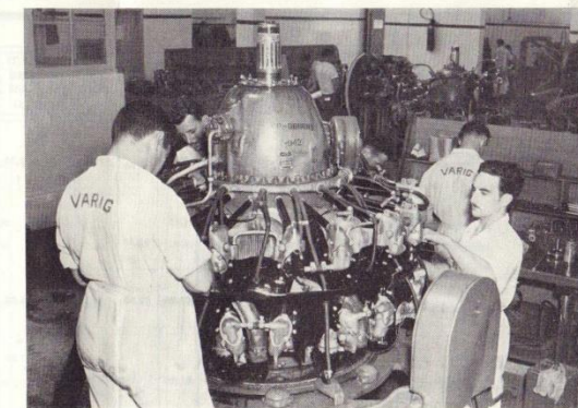
Head Office of VARIG — the Pioneer Airline of Brazil — Established 1927