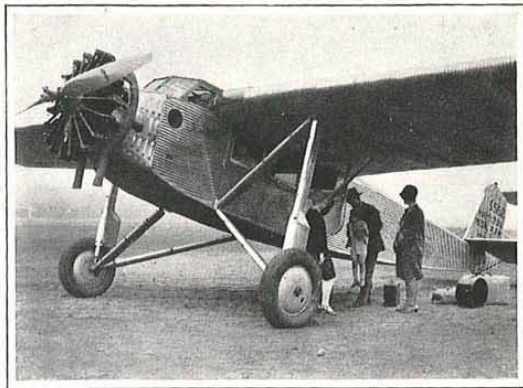
One of the Hamilton super-powered air cruisers of the Northwest Airways fleet