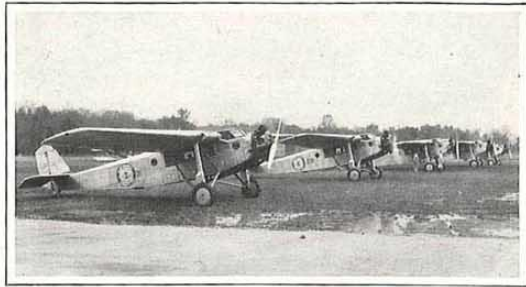
Fleet of Northwest Airways Hamilton planes "on the line" awaiting to take off