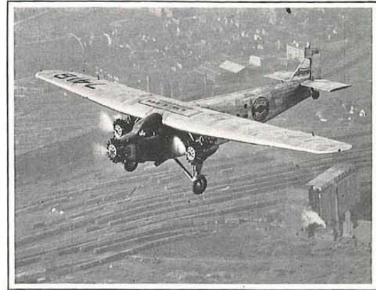
A graphic impression of Air-Rail Service.

AIR TAXI SERVICE AND SPECIAL CHARTERED FLIGHTS —The Northwest Airways will send its planes, manned by experienced air mail pilots, to any point on the North American continent. Available for this service is a fleet of modern planes accommodating from one to fourteen passengers.