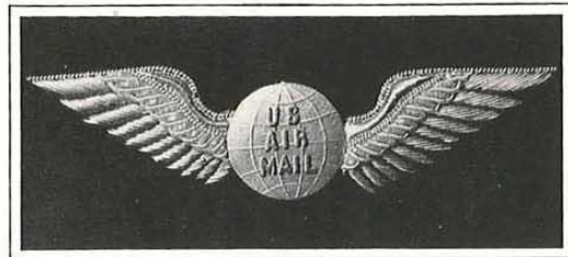
This insignia identifies Airmail Pilots

Equipment. The equipment of the Northwest Airways, Inc., ships, motors, and instruments are modern in all respects and maintained at all times in strictly first-class condition. United States Air Mail is carried on all regular scheduled flights in a special compartment, apart from the passengers. Operations are carried on in conformity with the high standard of the Post Office Department.