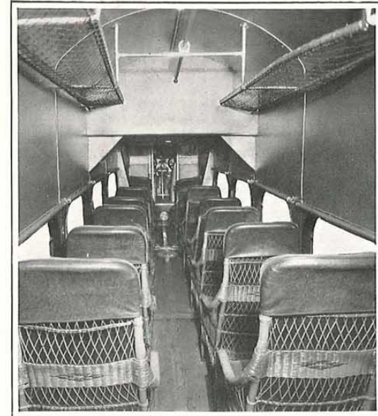
Interior of 14-passenger Ford air liner, standard equipment of Northwest Airways Service.

Children's Fares. Children under three years of age will be carried free if held on lap of parent or guardian. Children occupying seats, or children over three years of age will be required to pay full fare.