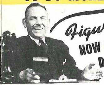
Figure It Up.. HOW MUCH IS A DAY OF YOUR TIME WORTH?