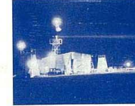
Airport floodlights make landing fields as bright as day.