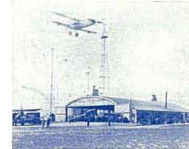
N-A-T plane leaving New York for the west.