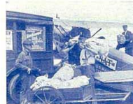
Loading 1,000 lbs. of Air Mail into an N-A-T plane.

*New York, N. Y. Bellefonte, Pa. Cleveland, Ohio Toledo, Ohio Chicago, Ill. Moline, Ill. St. Joseph, Mo. Kansas City, Mo. Wichita, Kan. Ponca City, Okla. Tulsa, Okla. Oklahoma City, Okla. Ft. Worth, Texas Dallas, Texas *Indicates location of Division Traffic Office.