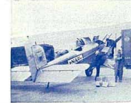
Loading Air Express. N-A-T planes have an average capacity of 1,000 lbs. of express or mail.