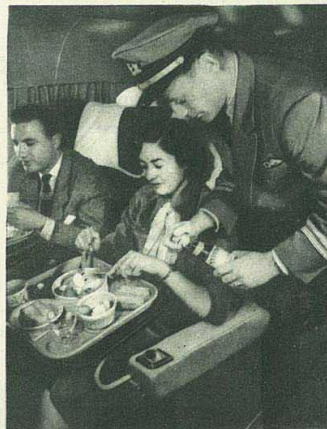
TASTY, HOT MEALS SERVED ALOFT At nominal charges

Fly THE FLAG CARRIER OF ISRAEL Constellation SERVICE TO FOUR CONTINENTS