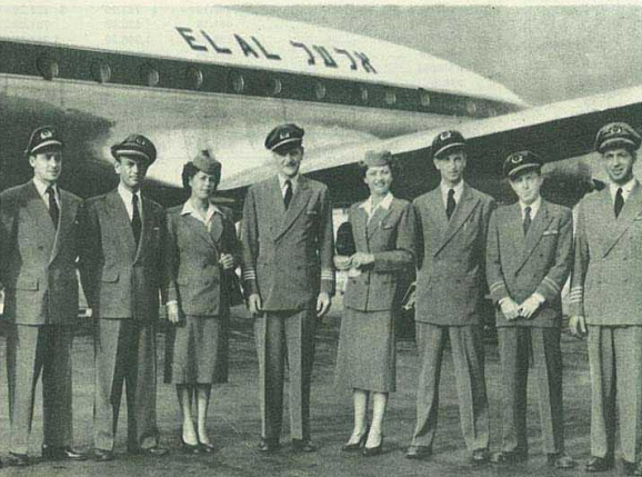
SEASONED CREWS — FRIENDLY CABIN SERVICE