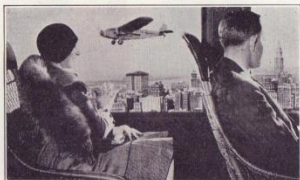
“Ships that Pass in the Sky”