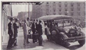
Boarding the Bus for the Airport