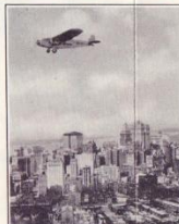
Manhattan from the Air