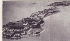
Fort Schuyler—A View Along the Sound