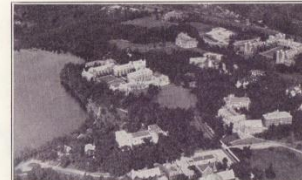
Beautiful Wellesley College from the Air