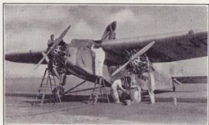
Trained Mechanics “Tune” the Plane