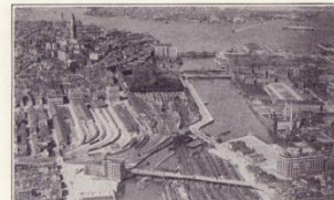
Downtown Boston and the Custom House