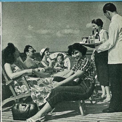
For everyone... a place in the sun

Passports, certificates, etc. should be carried in such a way as to be always ready for immediate presentation. Kindly do not pack them with your baggage.