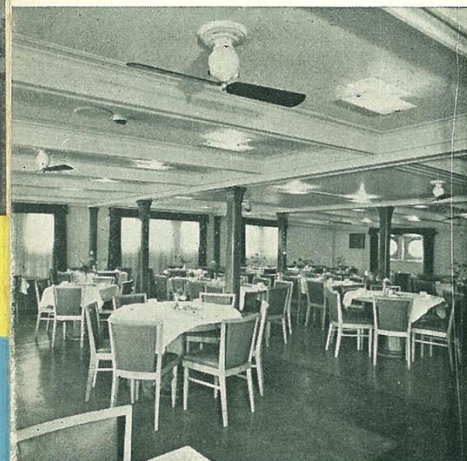
Bright and cheerful dining halls

Welcome aboard. You'll feel at home, for here you find some- thing for every mood; sun and fun... sport and entertainment... and complete relaxation in the liner's beautiful recreation rooms or on the spacious sundeck high above the sea. You will delight in strolling along "NEGBAH's" sweeping promenade decks... joining a game of darts or shuffle board... or just resting comfortably in your deckchair, soaking up the brilliant Mediterranean sun. Your children